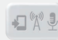
Choose Your Features