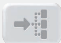
08 to IP Gateway SIP