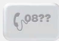
Choose Your Number